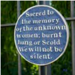
ROSIE'S PLAQUES Beautiful, handmade plaques created by women of The Common Lot were attached to significant buildings as a guerrilla art project this summer. They celebrate and commemorate radical women of Norwich and draw attention to the fact that out of 300 official plaques only 25 recognise female spaces and achievements.