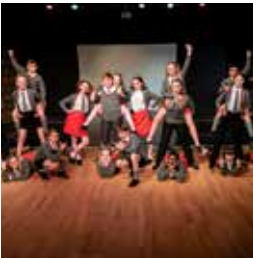
VICTORY FACADE AT ORMISTON VICTORY ACADEMY An award-winning company who work hard to produce quality theatre and magical experiences in the arts, inspiring the stars of today and tomorrow. Many students, over many years, have enjoyed the vast performance opportunities that have been offered to them by the group.