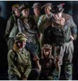
ECHO YOUTH THEATRE Echo was launched in December 2017 to offer young people accessible and flexible opportunities in theatre and performance, both off-stage, backstage and on stage. So far, their shows and workshops have given hundreds of young people the opportunity to perform and learn technical theatre skills alongside professionals and volunteers.