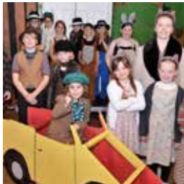
ST. GEORGE'S THEATRE YOUTH COMPANY A new weekly group based in Great Yarmouth, open to all young people aged between 7 and 16 years old. They learn acting skills, movement and voice, and use drama games to develop teamwork, friendship and confidence. Their performance of Wind in the Willows this year was a huge success.