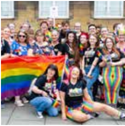
DEREHAM THEATRE COMPANY Formed in 1948, DTCo has celebrated its 70th Anniversary of providing entertainment and arts education for the local community. The company is a volunteer-run registered charity with a designated youth division, performing five productions annually including plays, musicals and pantomimes.