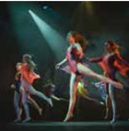
MICHALA JANE SCHOOL OF DANCE A performing arts school with classes in Norwich and Brooke covering ballet, tap, freestyle, street, commercial, contemporary and musical theatre for all abilities and ages from 3 to senior citizen. With regular performances, including a forthcoming 25th anniversary Theatre Royal show, they always give everyone their chance to shine.